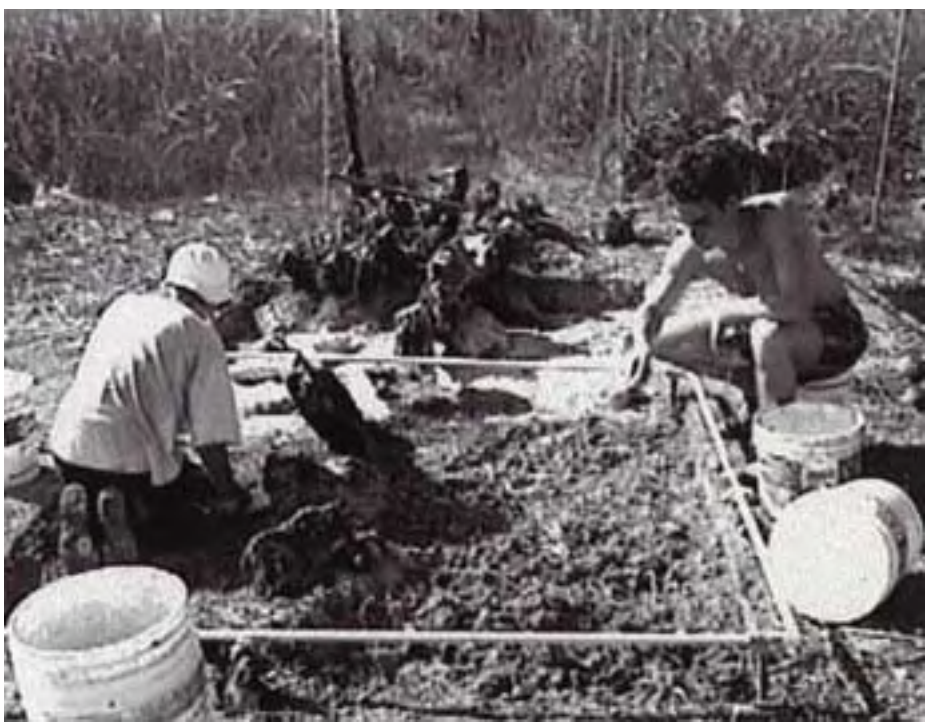
Figure 10. Excavations at Alignment 41.

Units of 2 m x 2 m were excavated to bedrock, with excavation levels separated by natural stratigraphic breaks and/or 10 cm intervals (Figure 10, shown above). At each alignment, all soil from at least one unit was water-screened with 1 mm mesh, with all materials retained in the screen being collected (Figure 11, shown below). In other excavation units, 1/4 inch screen was used for water-screening, and all artifacts were collected. Soil samples were collected from each excavation unit for recovery of macrobotanical remains, pollen, and phytoliths.