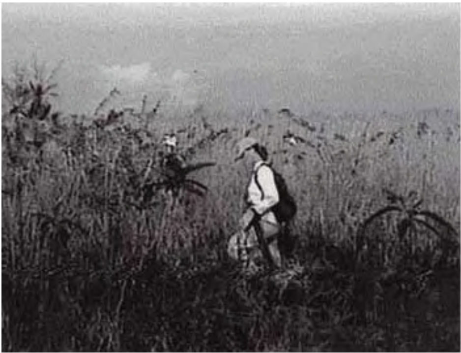
Figure 3. Archaeological survey within the El Edén wetland.