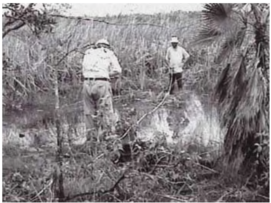
Figure 8. Mapping an alignment that crosses a water-filled channel.