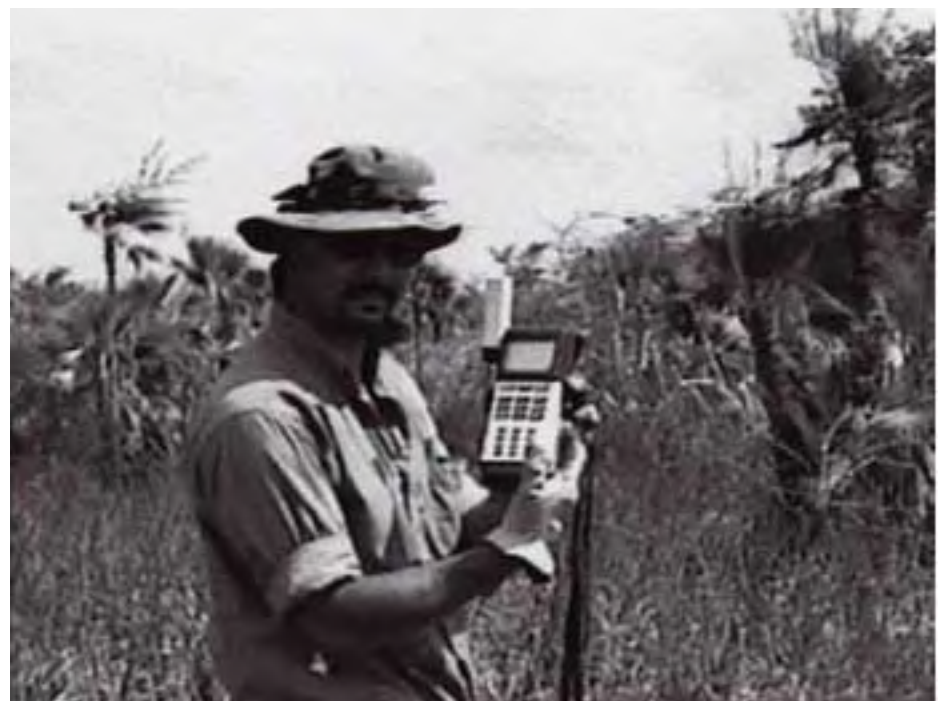
Figure 5. Using a Global Positioning System (GPS) receiver to determine the location of a feature.

Systematic survey of the wetland was conducted by a team of four to six archaeologists walking transects spaced at intervals of 10 to 20 m, depending on the density of vegetation cover (Figure 3, shown above). The survey extended to the margins of the wetland as defined by a distinct change in vegetation community. Each identified feature was mapped with compass and tape, described, photographed, and marked with an aluminum tag inscribed with a sequential number (Figure 4, shown above, and Figure 5, shown below). The location of each feature was determined with the use of a satellite-based Global Positioning System (GPS) receiver and with the aid of an enlarged aerial photograph of the wetland (Figure 6, shown below).