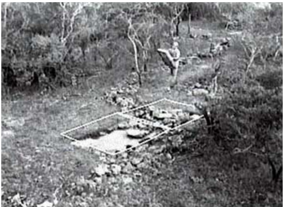
Figure 9. Excavations at Alignment 57.

Alignment 41 is representative of features that parallel the margins of the large depressions in the north and south ends of the wetland (Figure 7). Alignment 41 is the largest alignment recorded (approximately 700 m), and closes off the north end of the wetland. Alignment 42 represents features situated along the lowest margins of small natural depressions common in the north and south ends of the wetland. Alignment 57 is a zigzag shaped feature at the north end of a series of parallel alignments that run perpendicular to the slight north-to-south slope of the higher terrain situated in the central area of the wetland (Figure 9, shown below). One feature type, alignments that roross narrow channels at perpendicular angles, could not be tested due to the depth of standing water in the channels (Figure 8).