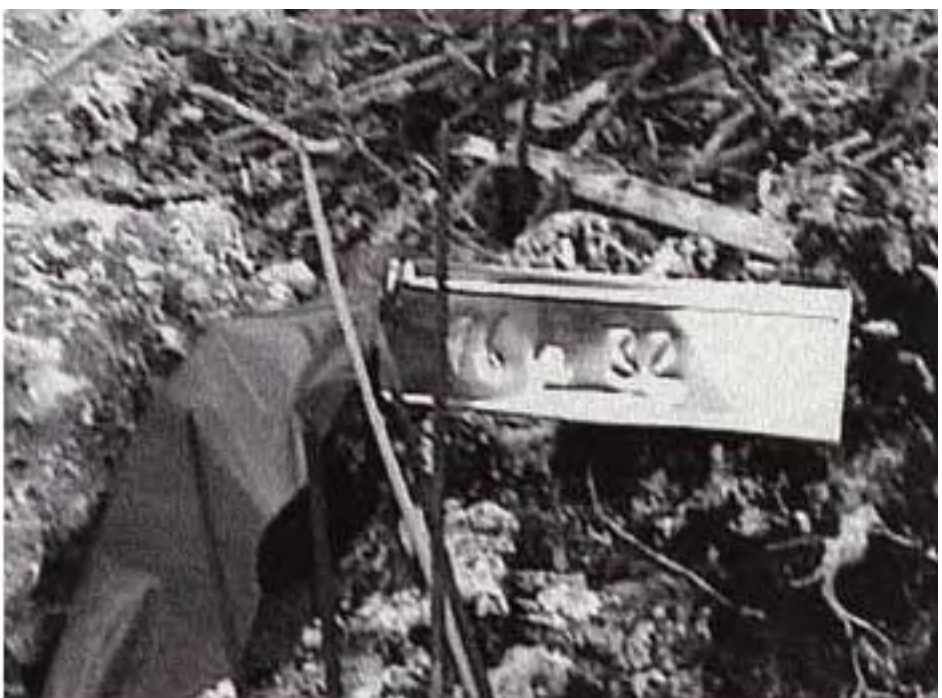
Figure 6. A permanent aluminum tag was attached to each feature.