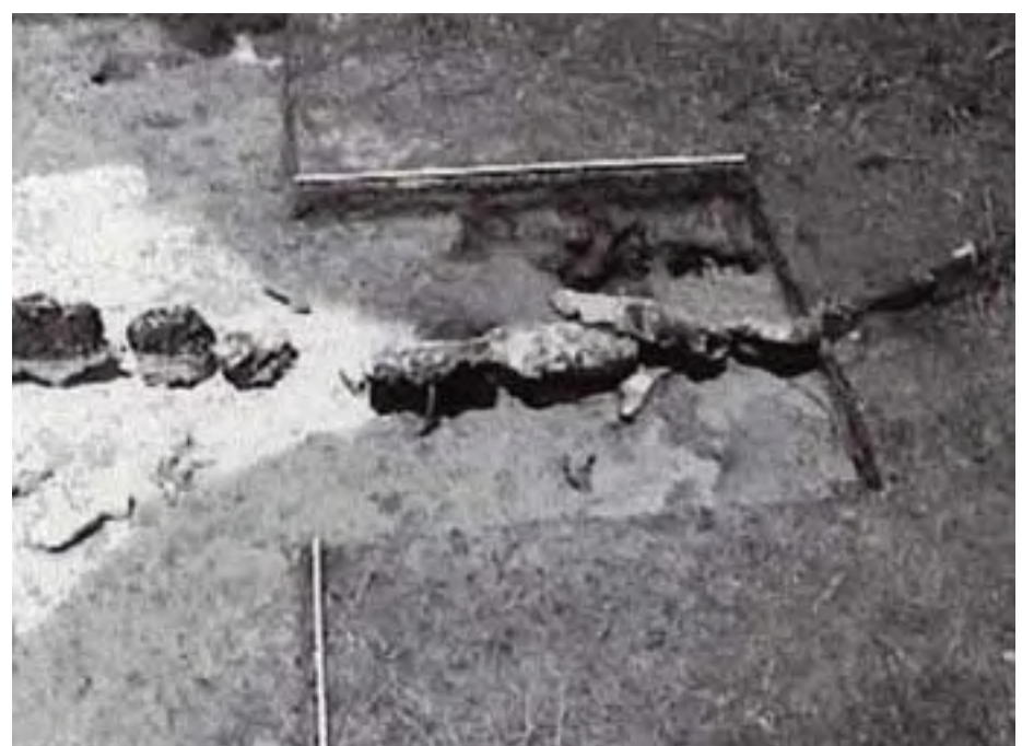
Figure 12. Exposed area of bedrock and Alignment 41 (the white rod near the top of the photograph is 2 m long).