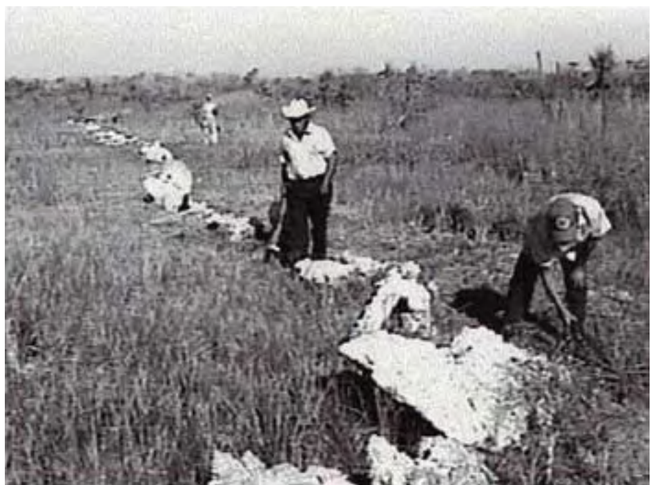
Figure 7. Alignment 41, located in the north end of the El Edén Wetland, is approximately 700 m long.