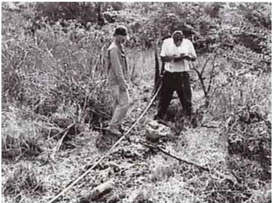
Figure 4. Mapping a rock alignment in the El Edén wetland.