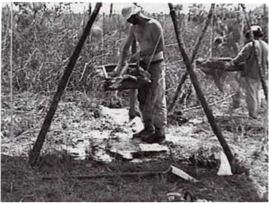
Figure 11. Water screening.