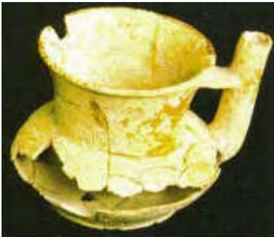
Vessel 3, Tomb 2, Chan Chich, Belize.