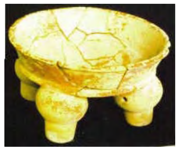
Vessel 2, Tomb 2, Chan Chich, Belize.