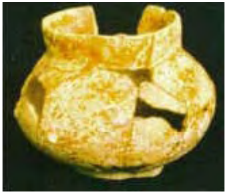
Vessel 6, Tomb 2, Chan Chich, Belize.

The section of the tomb which was exposed during the 1997 field season had been covered by nine large, rectangular limestone slabs, or capstones, oriented east-west and laid out side-by-side, across the top of the tomb. The plan view shape of the tomb was ellipsoidal, with the capstones covering the center of the tomb being slightly longer than those at either end. The tomb and the large-stone matrix placed above it were completely sealed by the construction of a Protoclassic floor. Subsequently, still in the Protoclassic, a small, low structure having stone walls was constructed upon this floor.