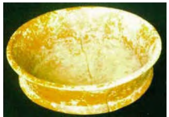
Vessel 4, Tomb 2, Chan Chich, Belize.