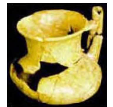
Vessel 1, Tomb 2, Chan Chich, Belize.

Research Year: 1998 Culture: Maya Chronology: Protoclassic Location: Orange Walk District, Belize Site: Chan Chich