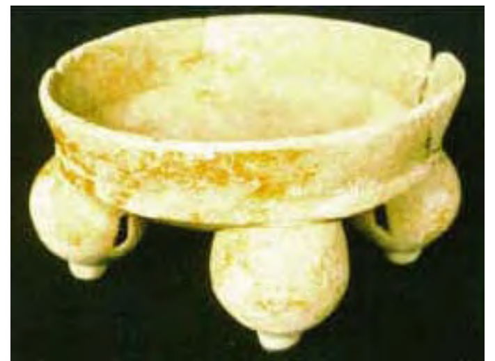
Vessel 9, Tomb 2, Chan Chich, Belize.

The size and complexity of the chamber and the exotic artifact assemblage clearly denote that the burial is that of an elite person at the site. The helmet-bib pendant is particularly important for understanding the social or political status of the tomb's occupant. Schele and Freidel have interpreted similar artifacts found at Cerros as being royal insignia jewels worn by the first king of the site. Generally, such artifacts are found only in elite contexts such as caches and tombs.