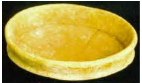
Vessel 7, Tomb 2, Chan Chich, Belize.

Three of the tomb capstones were found in-place in their original positions, revealing the tomb's original configuration. The majority of the capstones had collapsed to various depths within the chamber. The capstones in the center of the tomb had collapsed the farthest, and their fall had precipitated the creation of the hole on the surface of the