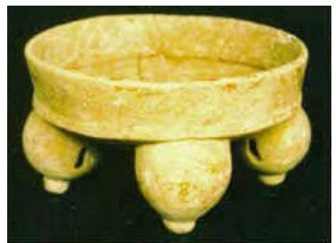
Vessel 8, Tomb 2, Chan Chich, Belize.

plaza. It should be noted that the capstone that fell the farthest did not fall all the way to the tomb floor. It landed, instead, upon a distinctive whitish, marly sediment at a level of about 15 cm above the tomb floor. It is unclear if this marl was deposited through natural or cultural processes. Whatever the case, the layer of fill protected the contents of the tomb from being smashed by the collapsing capstones. On the other hand, this marl deposit formed a very harsh depositional environment which probably accelerated the deterioration of the human skeletal material and several of the other artifacts.