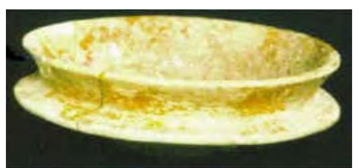
Vessel 10, Tomb 2, Chan Chich, Belize.

More in depth report: Chan Chich Archaeological Project